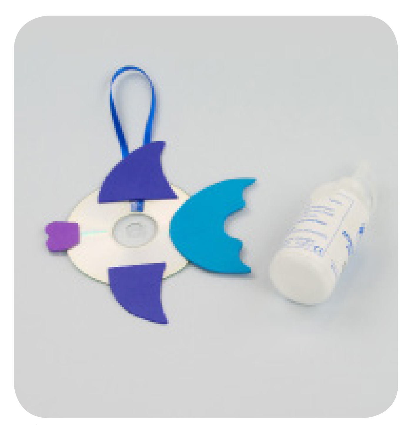
Step 3. Using PVA glue, stick the fins, tail and lips onto the non-shiny side of the CD. Do this so that they hang over the edge.