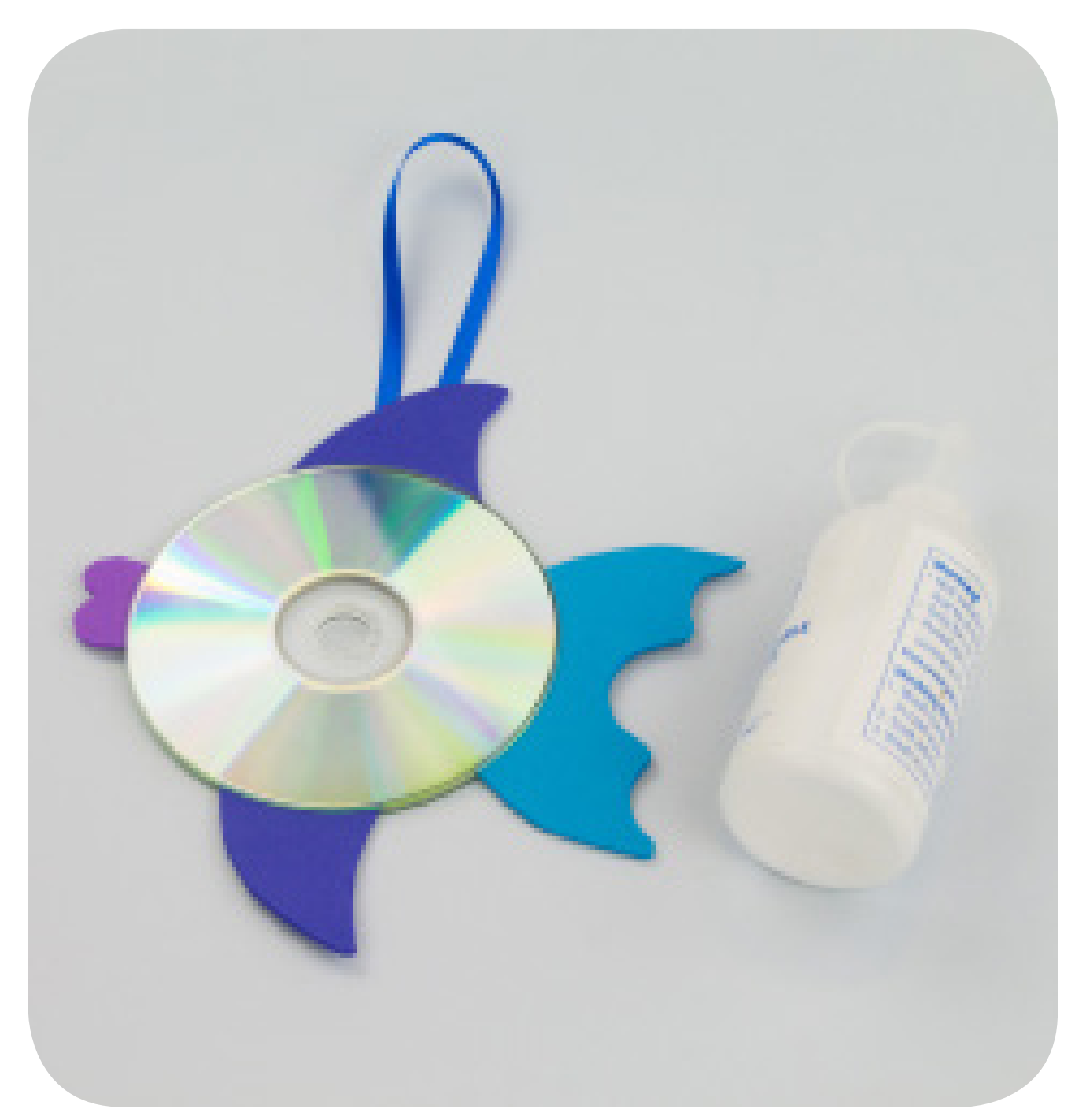
Step 4. Take the second CD and spread PVA glue on the non-shiny side of it. Then stick this onto the back of the other CD, so that both shiny sides are visible.