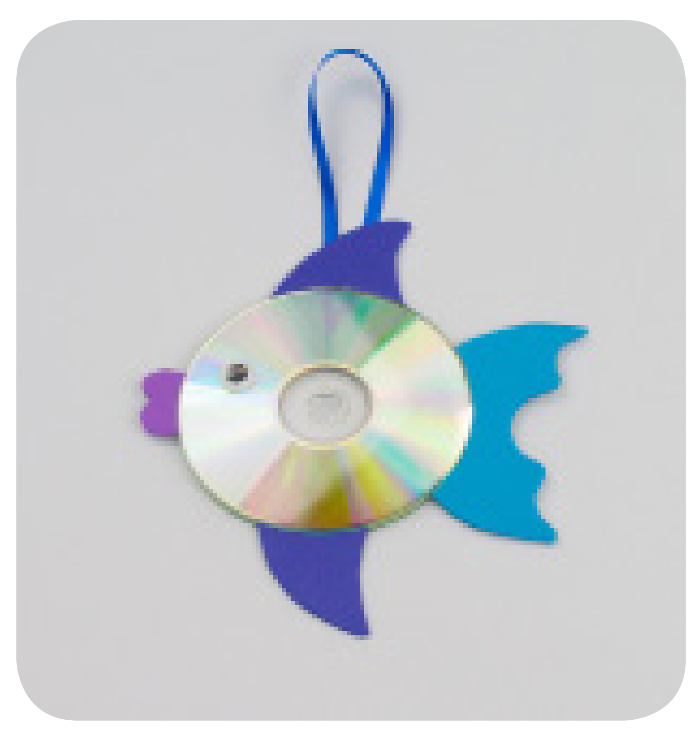
Step 5. Using PVA glue, stick a googly eye just above the fish's lips on both sides.