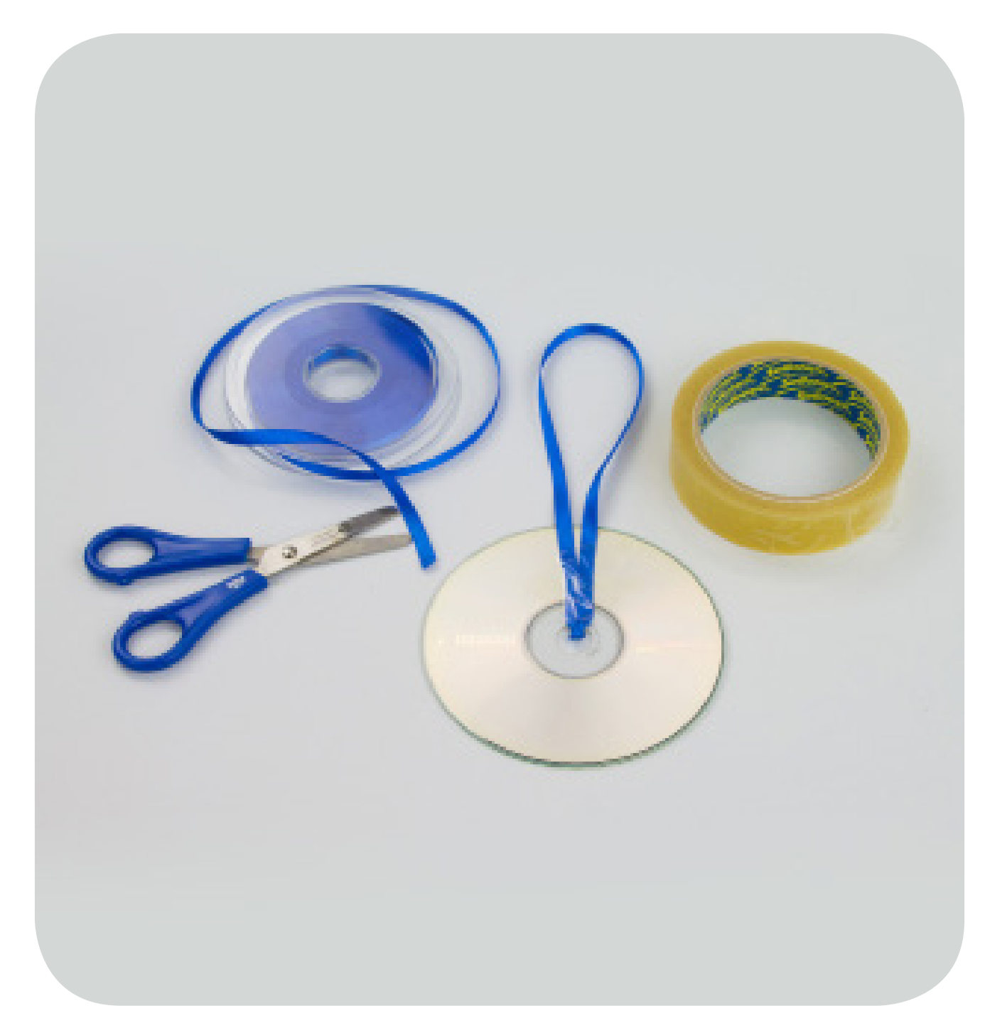
Step 2. Tie a length of ribbon into a loop. Then tape this onto the non-shiny side of one of the disks.