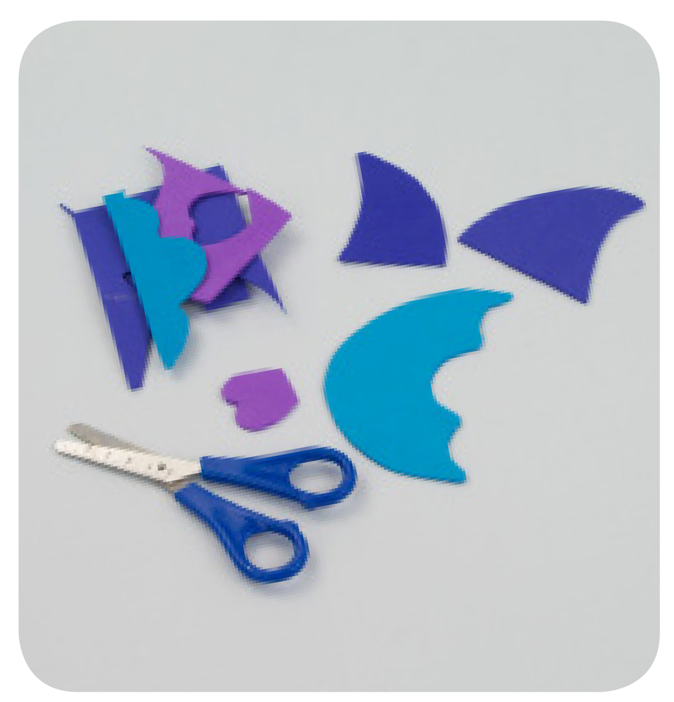
Step 1. Draw 2 fins, a tail piece and lips onto the coloured foam. Then cut the foam shapes out using scissors.