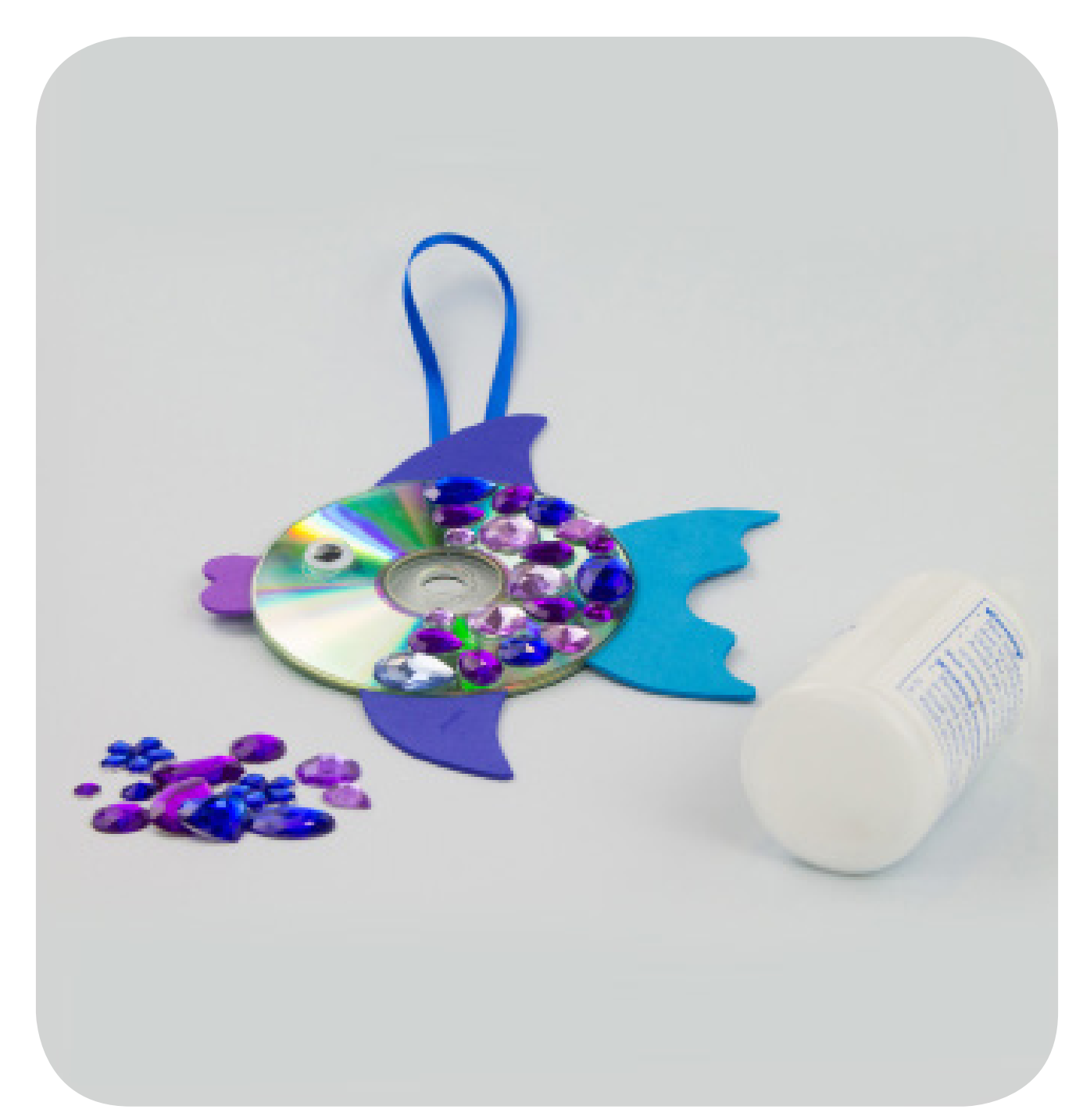
Step 6. Now decorate both sides of the fish. To do this, stick sequins and jewels on using small amounts of PVA glue.