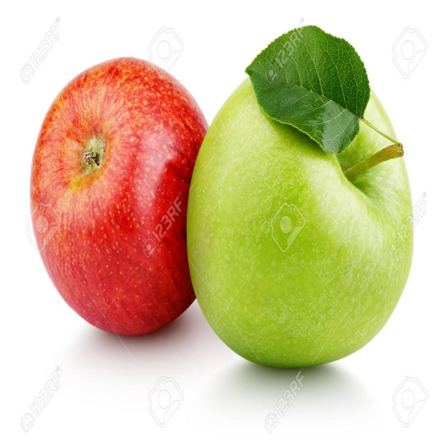
It is an apple