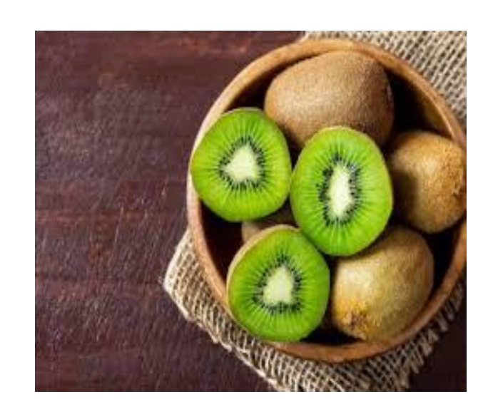
It is a kiwi