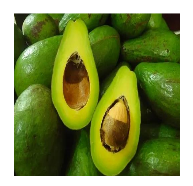
It is an avocado