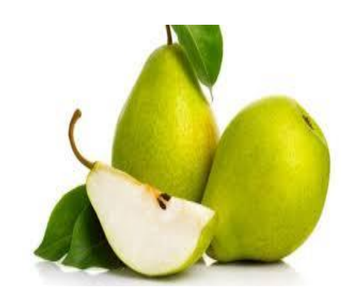
It is a pear