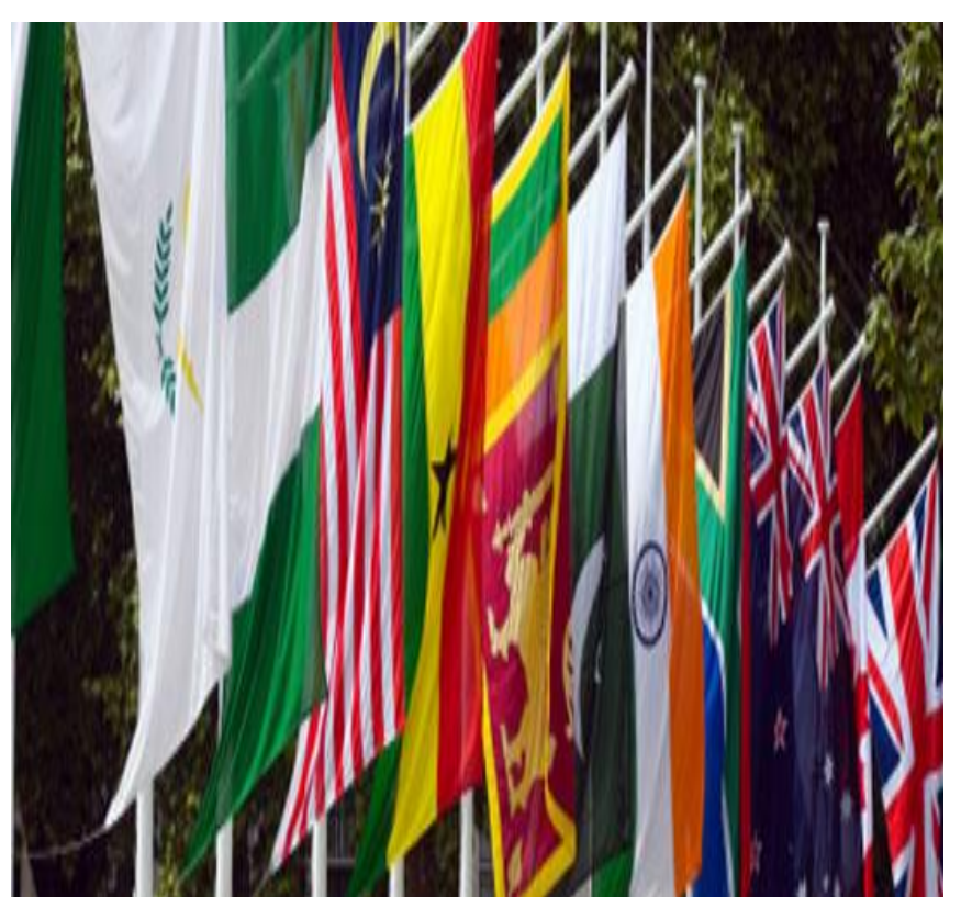
Nigeria a member of the British commonwealth.