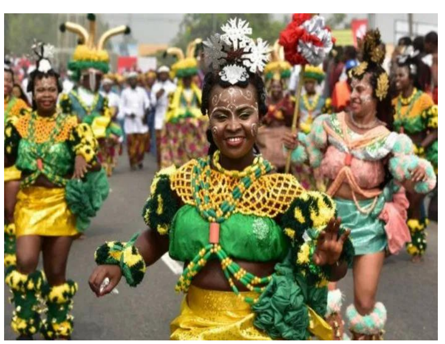
and over 500 languages are spoken in Nigeria.